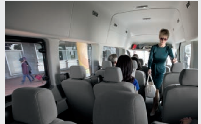
15-passenger XLT HR LWB EL cloth-trimmed interior in Pewter with available equipment.