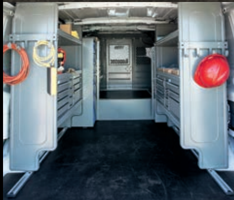
Adrian Steel General Service Cargo Management Package shown in an LR Van with available equipment.