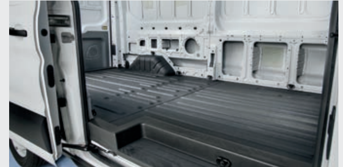
Rear view camera display 1 (top). Tough Bed ® spray-in cargo floor liner 1 (bottom).