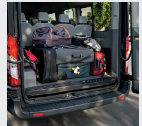
15-passenger XLT HR LWB EL cloth-trimmed interior in Pewter with class-best factory-built cargo capacity and available equipment.