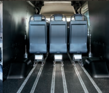
TransitWorks SmartFloor flexible flooring system shown in an HR Van with available equipment.