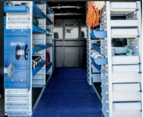
Masterack ® SmartSpace ® General Contractor Package shown in an MR Van with available equipment.