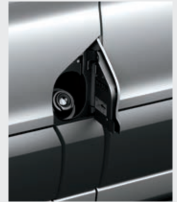
Easy Fuel® capless fuel filler.

1 Row availability varies by seating configuration.