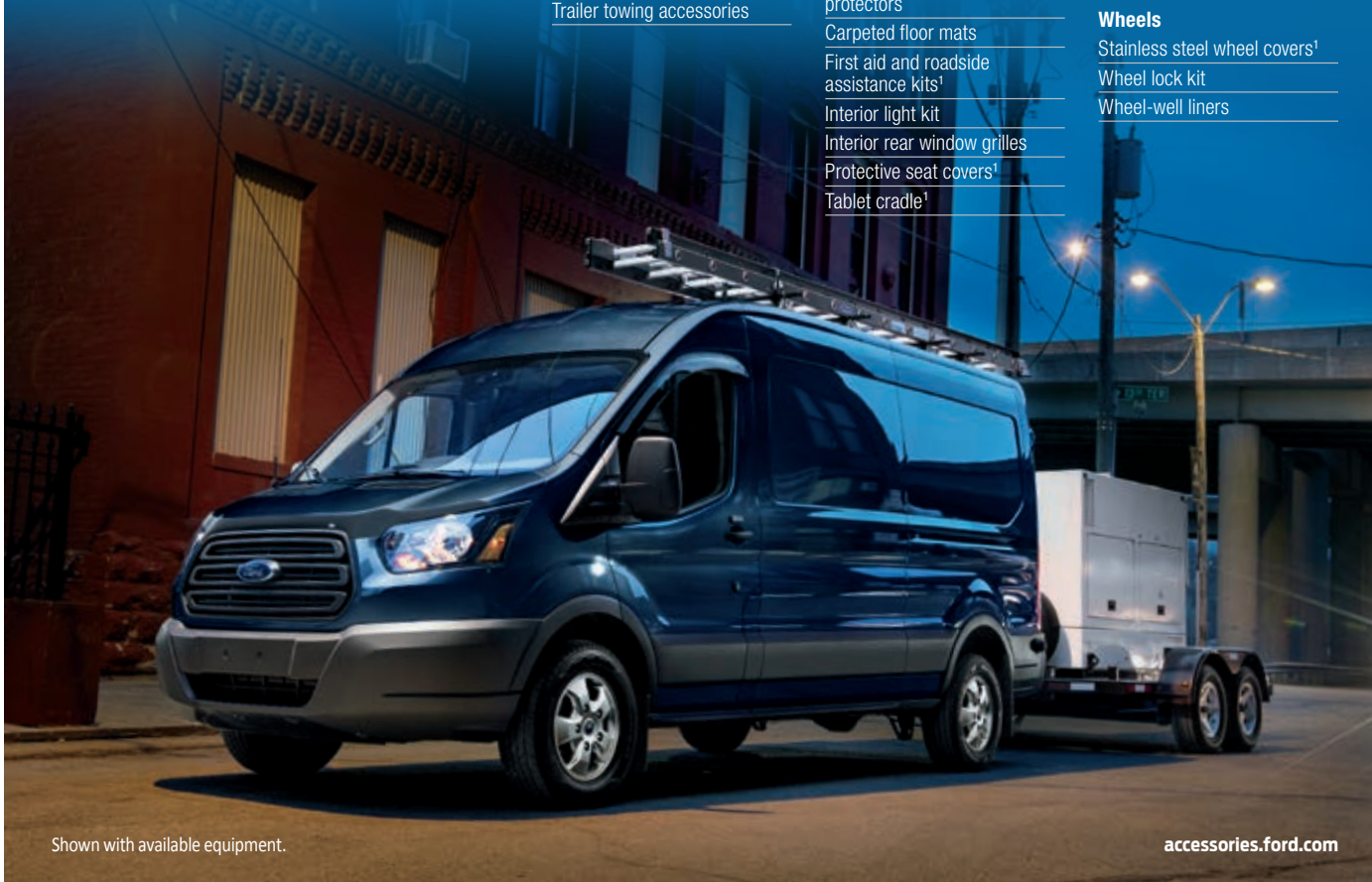
Shown with available equipment.