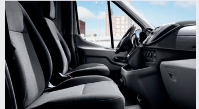
Cloth-trimmed 2 interior in Pewter with user-defined upfitter switches 2 and available equipment.